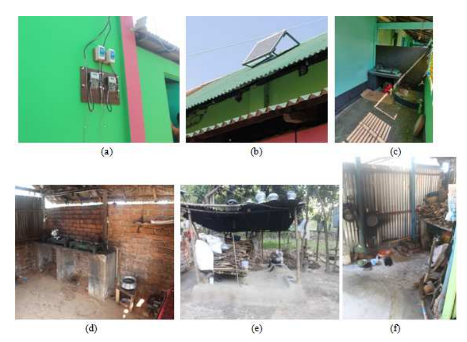
Figure 9: (a), (b) & (c) Showing Electricity Supply and uses of Solar Panel in Better Housing Units which has Attached Toilet and Kitchen and (d), (e) & (f) Showing Semi Permanent and Temporary Structured Common Kitchen both with Gas Stoves and Mud Stoves Facilities.

Almost all the communal housing units in such sub urban areas have common kitchen with gas and electricity supply. It was good to notice from the study that solar panels were used by the owners to produce electricity of the houses in one of the houses. They have gas stoves, but they are costly and used them occasionally, whereas mud stoves are used daily which are placed at the common kitchen at corner of the central courtyard. All the common kitchens were found built with temporary structure such as tin/ bamboo walled with pitched thatched roof.