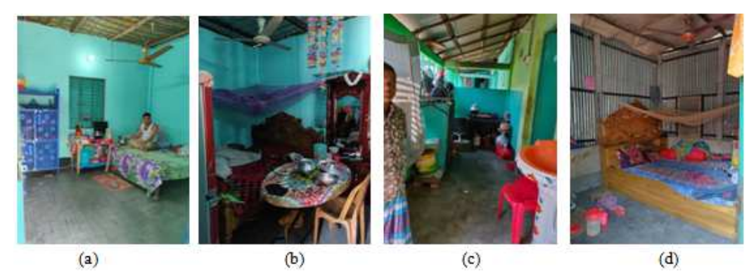
Figure 3: (a),(b),(c) & (d) Multiple uses of Workers' Interior Living Spaces: Eating, Sleeping, Cooking and so on.

During week days, the women workers remain in the factories for more than 10 to 12 hours in a day. Their dwelling units remained lock and sometimes used by partners/relatives during this period. At night and on weekend, they use their limited units in multiple ways such as eating, gossiping, reading, watching T.V. taking rest and so on.