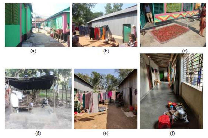
Figure 6: (a), (b), (c), (d) Showing Multiple uses of Central Courtyard Cloth Drying, Drying Spices, Cooking in Outdoor with Mud Stoves and (f) Common Veranda in Various Uses.

Here, only veranda and courtyard were regarded as lively and enjoyable area of these working women, as it is the only extension of their living units. The courtyard acted as a communal living space in the shiny sun rays during daytime where they could perform different outdoor activities such as clothes, food, spices drying, food cooking in mud stoves, sitting and gossiping with the neighbours and relatives. This courtyard acts as a daily social gathering space characterizes the rural community of Bangladesh.