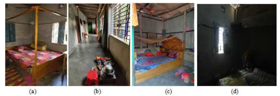
Figure 5: (a), (b) Showing Good Daylight and Proper Ventilation Through Veranda of Brick Built Houses and (c), (d) Showing Poor Daylight and Ventilation of Low Cost Tin Walled Temporary Houses.

and another towards the courtyard. Therefore, ventilation is moderate during daytime in summer. The sharp pitched tin roof helped to drain out the rain water during rainy season. Here, the brick walled housing units work as insulator where as the tin/corrugated shits walls of the dwelling units get the reverse results. During summer daytime, these units remain very hot due to the absorption and passing of the heat from Sun and on the other hand in winter, these room dwellers face harsh coldness inside. As a result, most the dwellers of these rented houses showed their dissatisfaction regarding comfort ability.