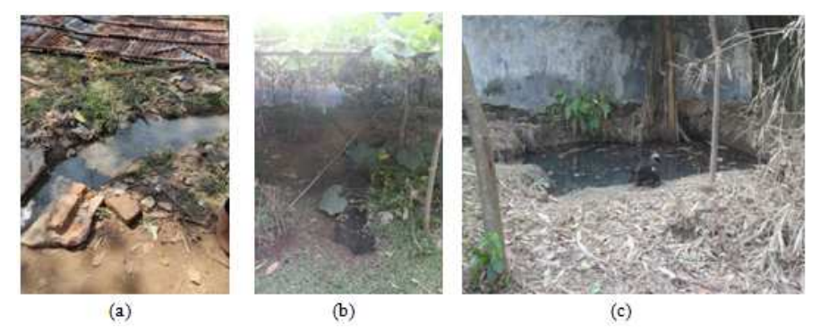
Figure 8: (a), (b) & (c) Showing Poor Drainage System All Disposals Accumulated to Nearby Houses.

The drainage and disposal of garbage were also common problem here. There were hardly any drainage system and dirty water and disposals accumulated and remained in the outer periphery of the houses, narrow walkway sides and the surrounding ditch areas.