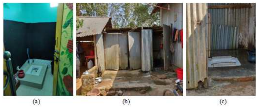
Figure 7: (a) Showing Permanent Built Attached Toilet with Fine Finished Material in Good Condition and (b), (c) Very Poor Temporary Built Common Toilets and Bath Facilities.

Water, Health, sanitation, drainage system and solid waste disposal: The dwelling units with attached toilet have piped water supply with deep water pumps. Other houses having common kitchen, toilets, bath and wash area has to rely on common water tap and sometimes, hand pump for all. There is no proper distribution of water, electricity and gas supplies due to demand and supply issues of these areas. Considering healthcare and comfort issue regarding toilets especially for women workers, the survey found sanitation system provided to them are in a very poor condition. The survey result found that the common toilets for male and female were inadequate in numbers, made of temporary structures, lack of proper maintenance and most of them without septic tank and sewerage connections. Hence, the poor condition of the sanitation system may cause unhygienic risks to transmit infectious diseases to these women.